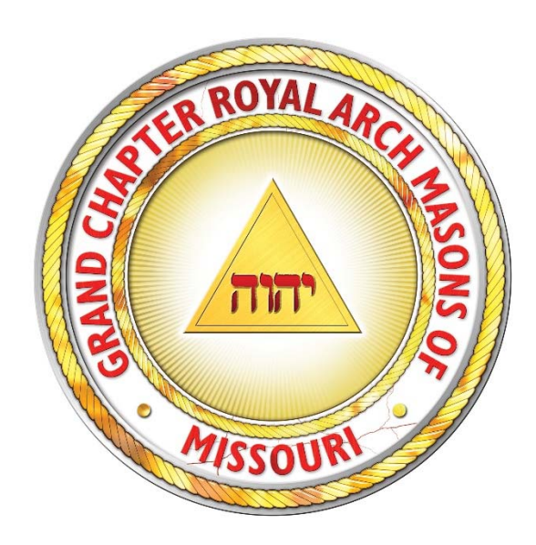
HELD JUNE 6, 2019 CAPITOL PLAZA HOTEL JEFFERSON CITY, MISSOURI